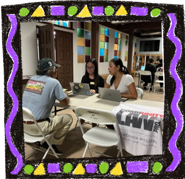
CLP student intern and local undergraduate interpreter serving a client at CLP's Solana Beach site.