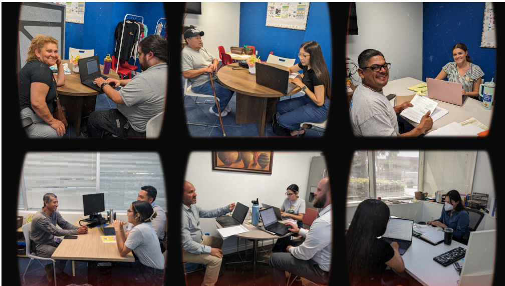
CLP students and interpreters providing services in collaboration with the Chicano Federation.