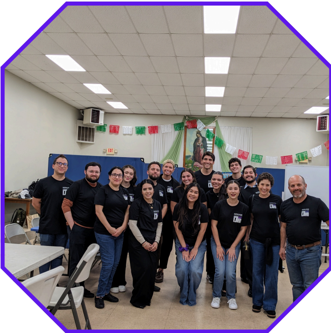
CLP students, interpreters and staff at a pop up legal clinic with a community partner.

Congratulations to our students for successfully completing the various components of our program, which included a visit to the San Diego Superior Court to learn more about the small claims process, a guided tour of the Family Law Facilitator Office and Unlawful Detainer Clinic, and an opportunity to hear from attorney panelists representing organizations that CLP works with on a regular basis. These highlights were on top of our regular class case rounds, coverage of important substantive legal issues, and the students' weekly clinic duties.