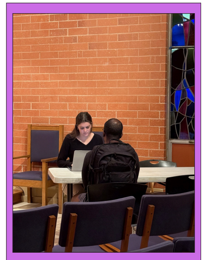
CLP students providing services to community members at our community legal clinics.