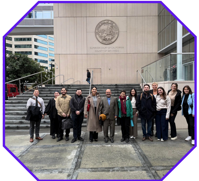
CLP students and their professors take a field trip to the San Diego Superior Court to learn more about the self-help services available to the public.